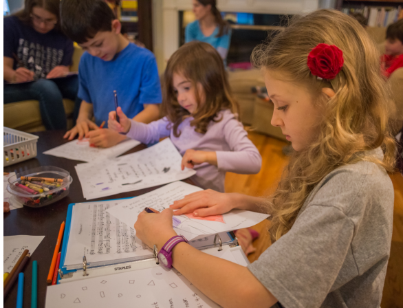
Scripture Melodies Enrichment Class